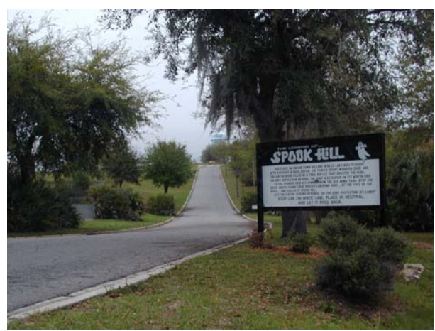
Figure 3. Spook Hill