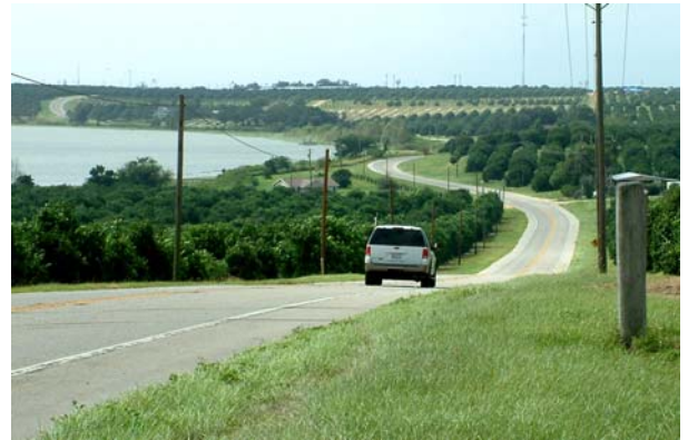
Figure 2. Lake Moody Viewpoint