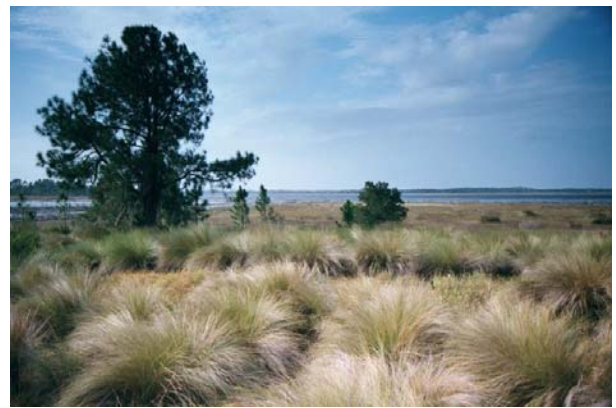
Figure 4. Crooked Lake Prairie