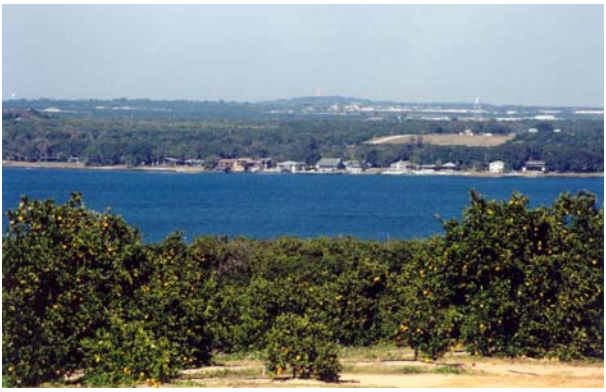
Figure 1. Bok Tower as seen from the Windy Hill Viewpoint