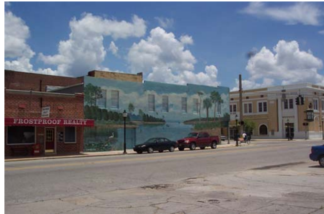
Figure 7. Downtown Frostproof Mural