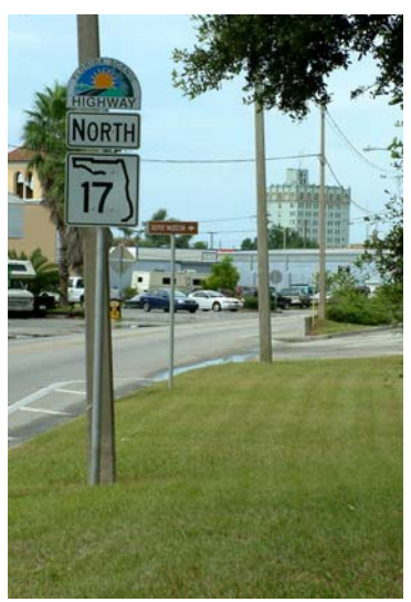
Figure 5. Downtown Lake Wales