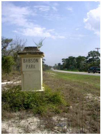
Figure 6. Babson Park Marker